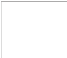
A - 1000mm length