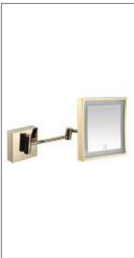
A - 410 X 205mm