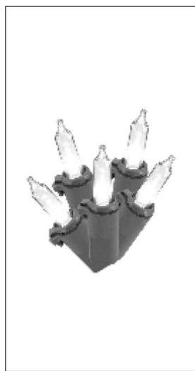
A - Length - 7.5m